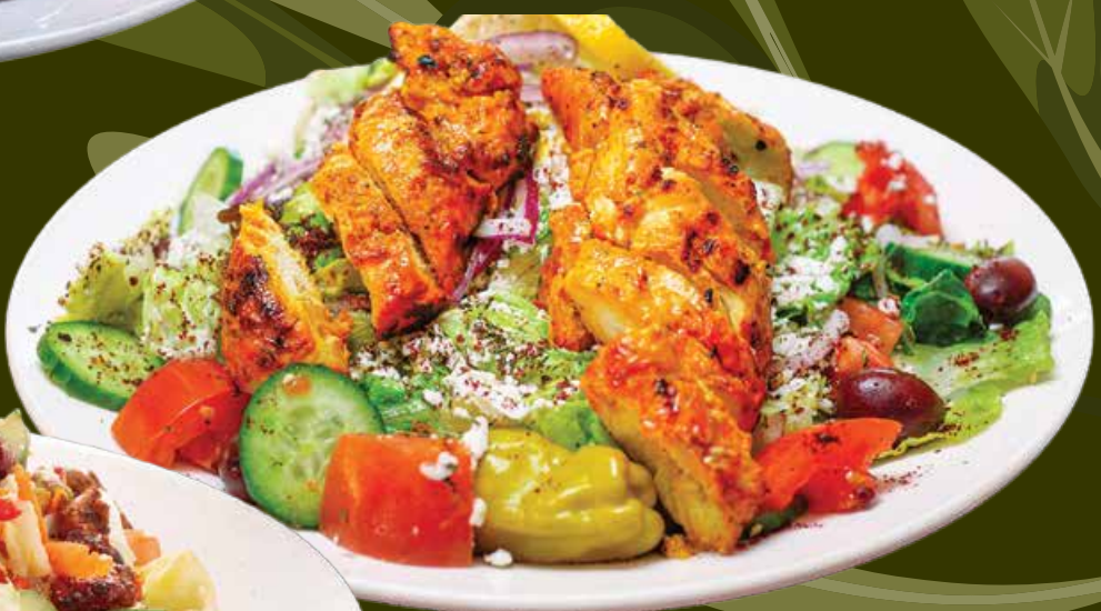
GREEK SALAD WITH CHICKEN TIKA KEBAB