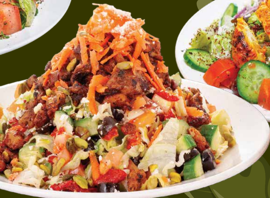
CHOPPED CHICKEN SHAWERMA SALAD