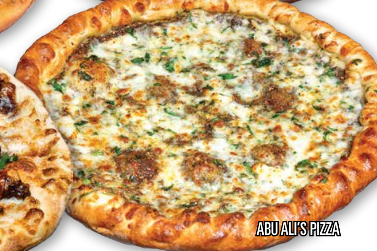
ABU ALI'S PIZZA