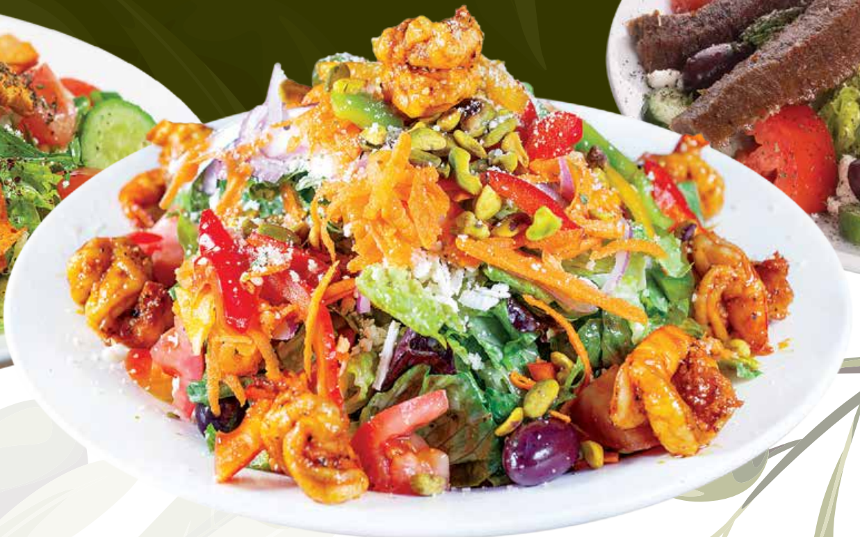
PASSION FRUIT SHRIMP SALAD