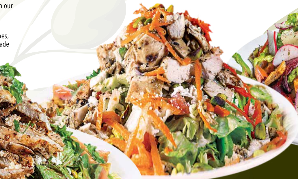
CHOPPED CHICKEN SALAD