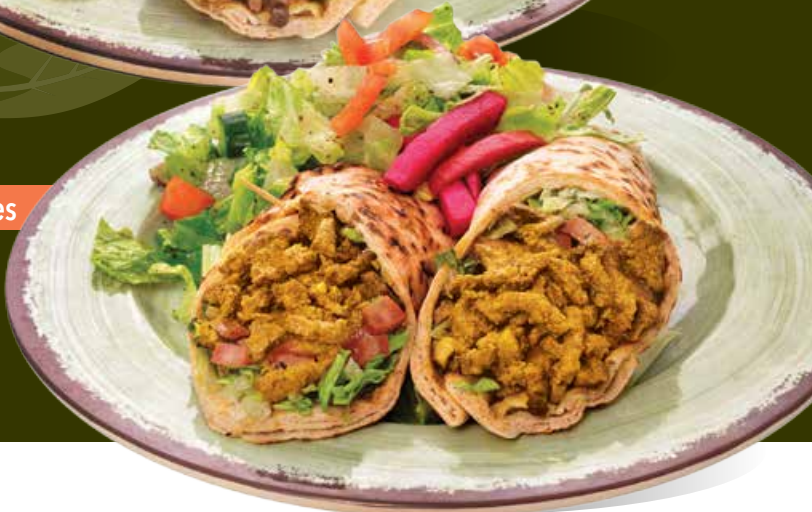
CHICKEN SHAWERMA WRAP