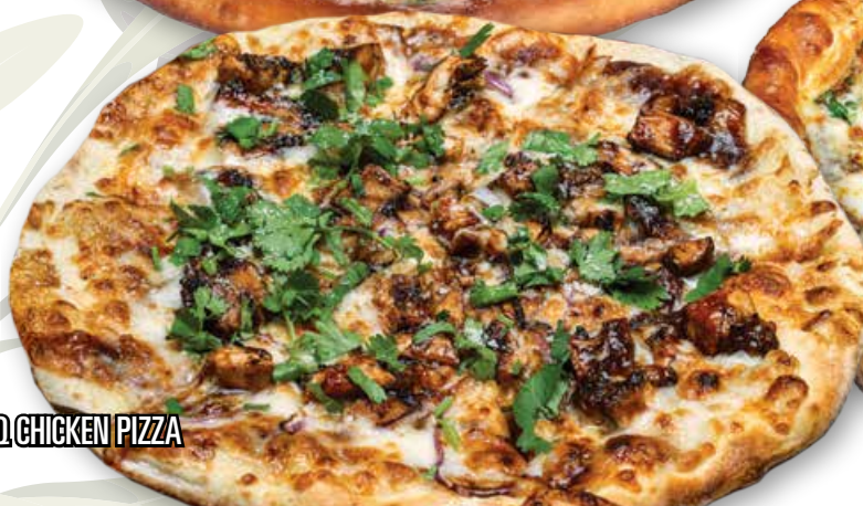
AYA'S BBQ CHICKEN PIZZA