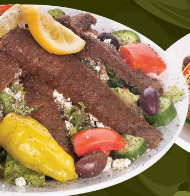
GREEK SALAD WITH GYROS