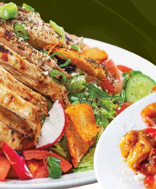
MEDITERRANEAN CHICKEN SALAD