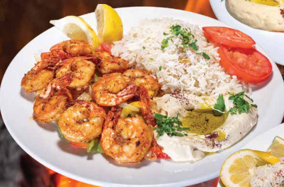
#12 SHRIMP KEBAB