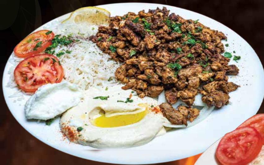
#1 CHICKEN SHAWERMA