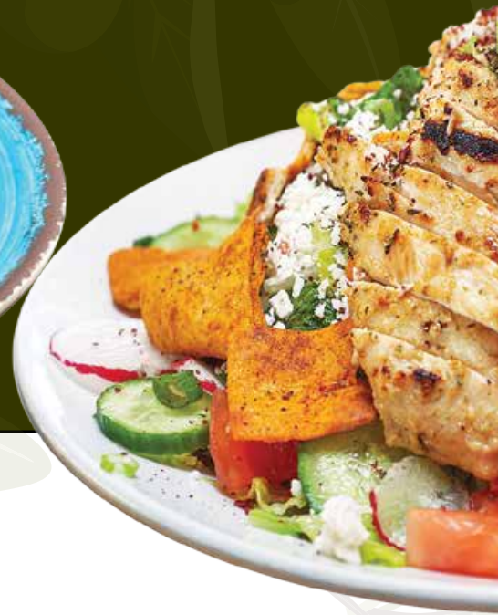
ALADDIN MEDITERRANEAN CHICKEN SALAD