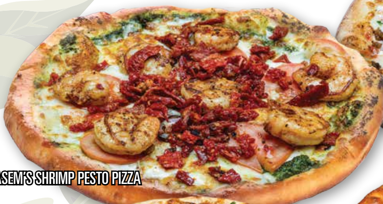
SAMASEM'S SHRIMP PESTO PIZZA