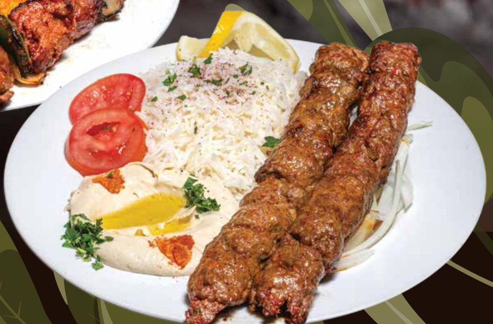
#6 BEEF & LAMB KOFTA KEBAB