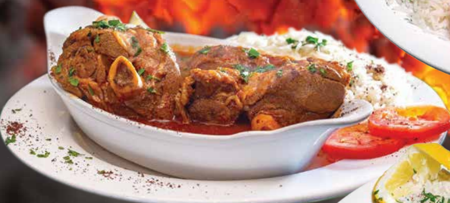
#14 LAMB SHANK