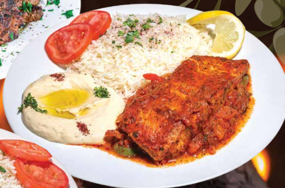
#10 SALMON ARRABIATA