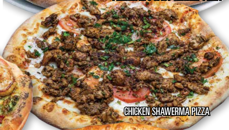
CHICKEN SHAWERMA PIZZA