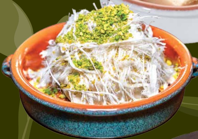
PISTACHIO HALVA WITH ICE CREAM