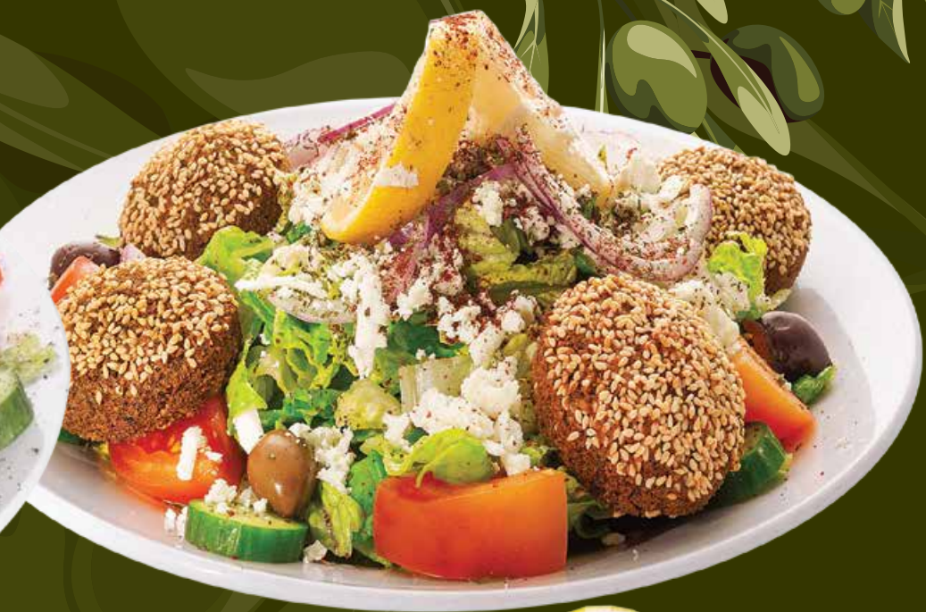
GREEK SALAD WITH FALAFEL