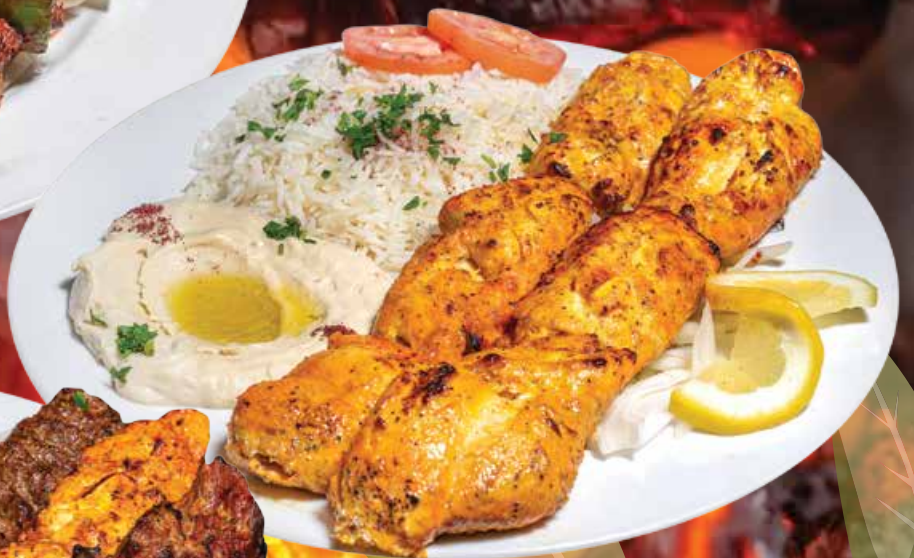
#4 CHICKEN TIKI KEBAB