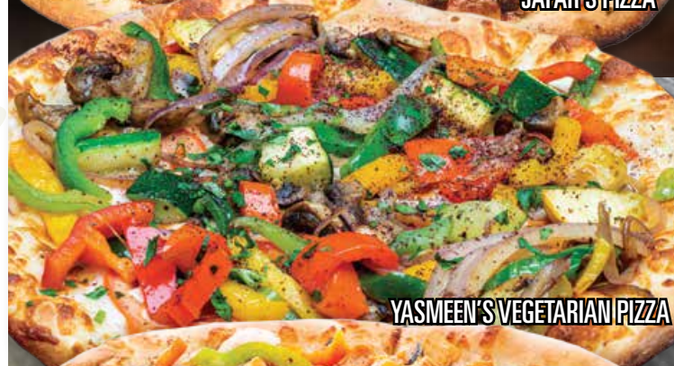
YASMEEN'S VEGETARIAN PIZZA