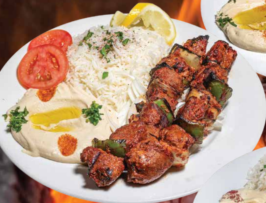
#3 LAMB TIKI KEBAB