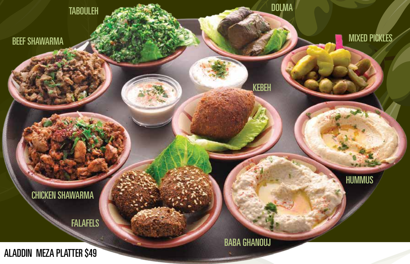
ALADDIN MEZA PLATTER $49