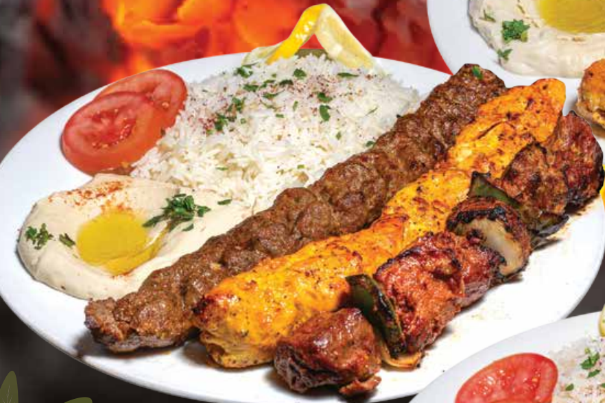
#5 SHISH KEBAB MIX