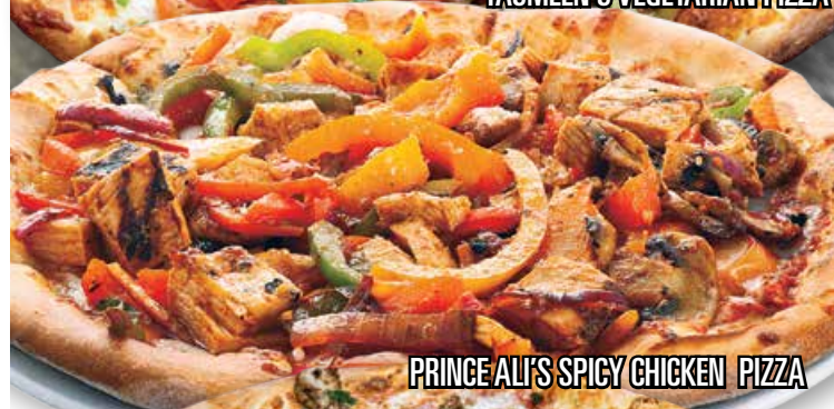
PRINCE ALI'S SPICY CHICKEN PIZZA