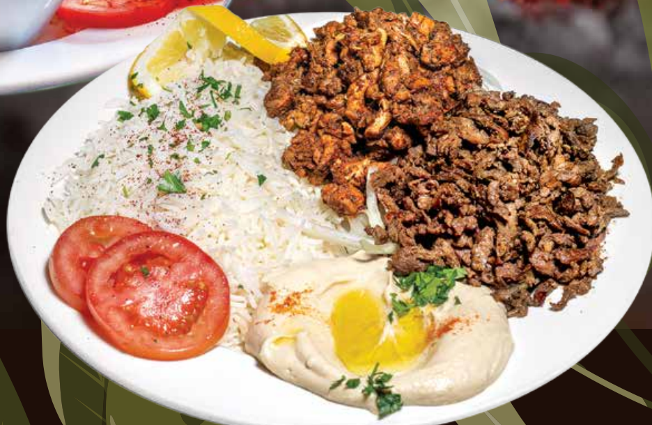
#15 1/2 CHICKEN & 1/2 BEEF SHAWERMA