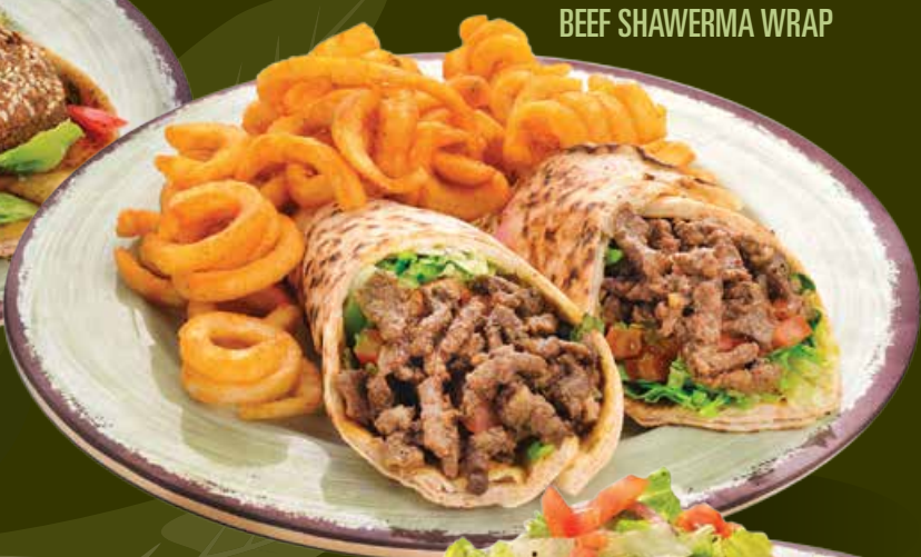
BEEF SHAWERMA WRAP