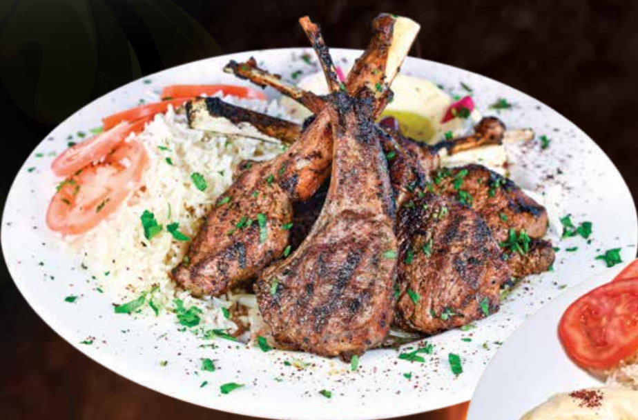
#9 LAMB CHOPS