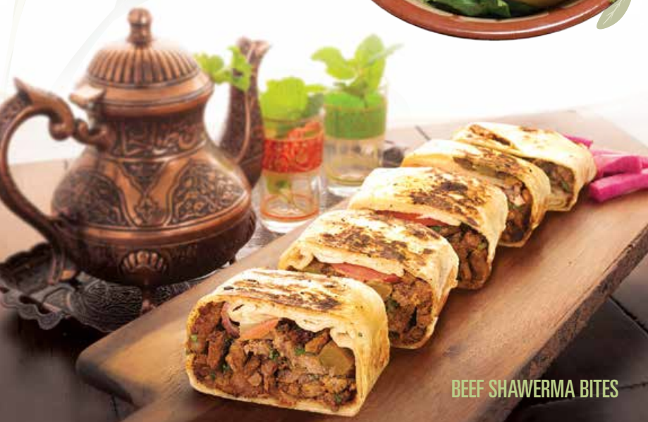
BEEF SHAWERMA BITES