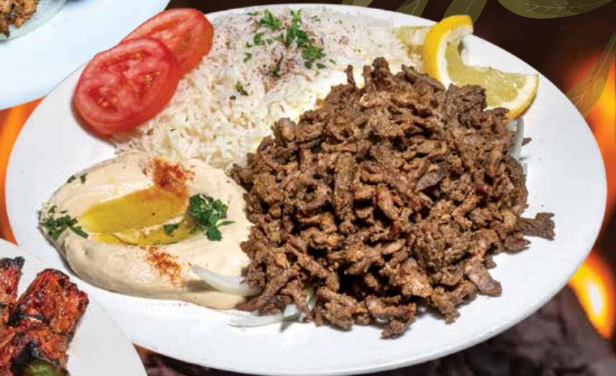
#2 BEEF SHAWERMA